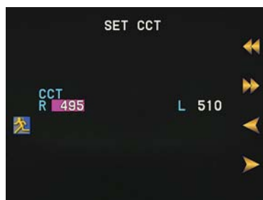
Entered patient's corneal thickness