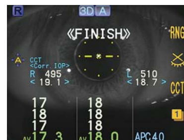
Compensated patient's IOP